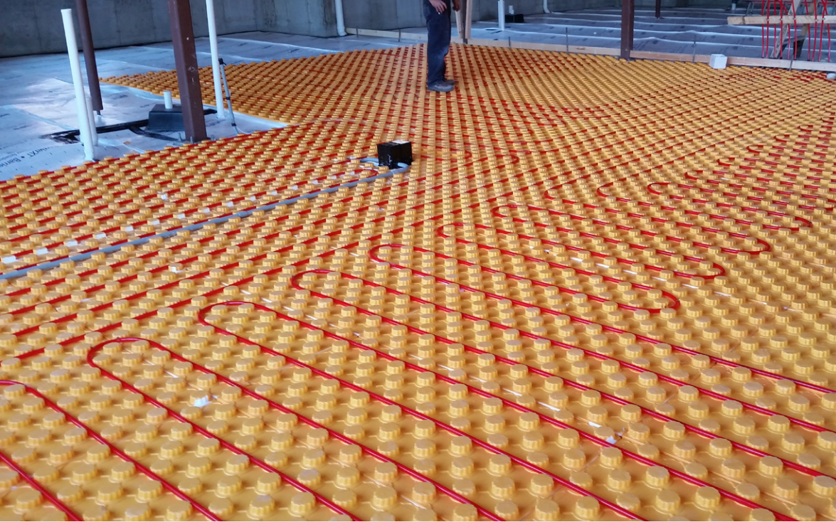
Radiant floor tubing